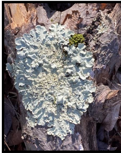
Lichen at Super Science Saturday