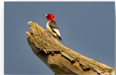
Red-headed Woodpecker