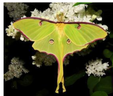
Luna Moth